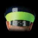
Min Qty 10